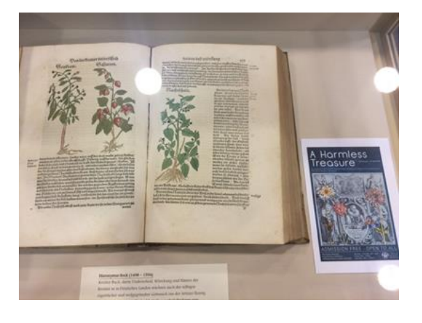
Exhibition of rare and beautiful herbal illustrations from the 16th and 17th centuries

The day was rounded off with a tour of the RSM library: one of the largest postgraduate biomedical lending libraries in Europe. Collections include journals and rare books such as a Roman 1st Century medical treatise, Celsus's De Medicina pub. 1478. There was also the opportunity to view an exhibition of rare and beautiful herbal illustrations from the 16th and 17th centuries, which is free to attend and runs until 27<sup>th</sup> April 2019.